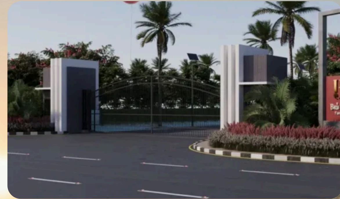
GRAND ENTRY GATE