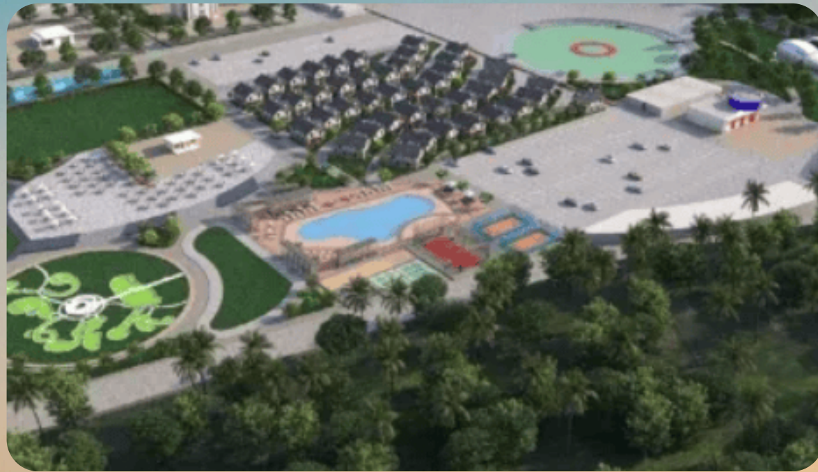
25 ACRE 5 STAR RESORT